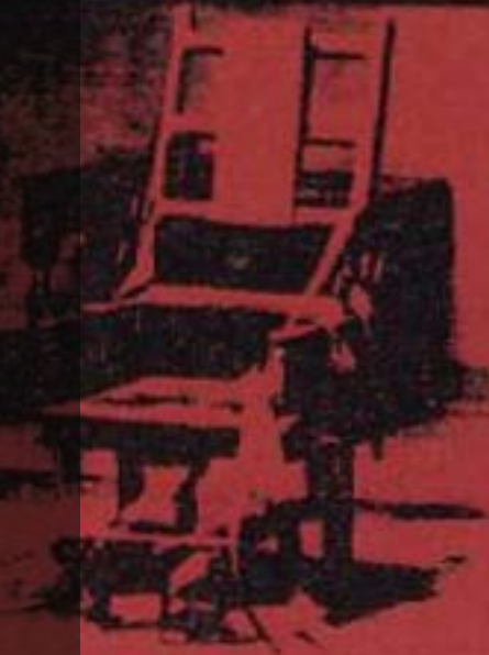
ELECTRIC CHAIR (1963), ANDY WARHOL

EDMUND BURKE, A PHILOSOPHICAL INQUIRY INTO THE ORIGIN OF OUR IDEAS OF THE SUBLIME AND THE BEAUTIFUL (NEW YORK: HARPER, 1757), 72.