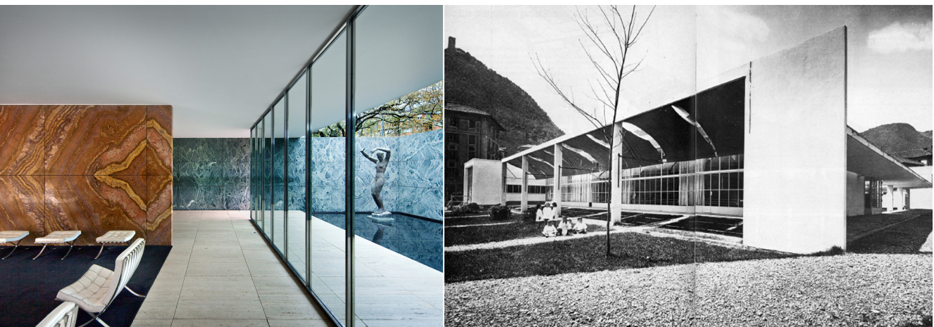
Mies van der Rohe, German Pavilion, Barcelona, 1929

Students will be able to record, transmit, and translate formal concepts and strategies such that they are applicable to their own design work as well as understood relative to related contemporary discourse.